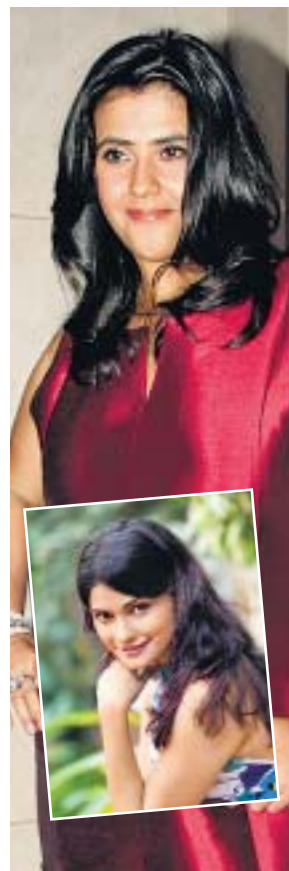
Prachi Desai on EKTA KAPOOR