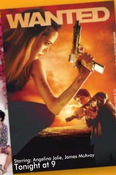
Starring: Angelina Jolie, James McAvoy Tonight at 9