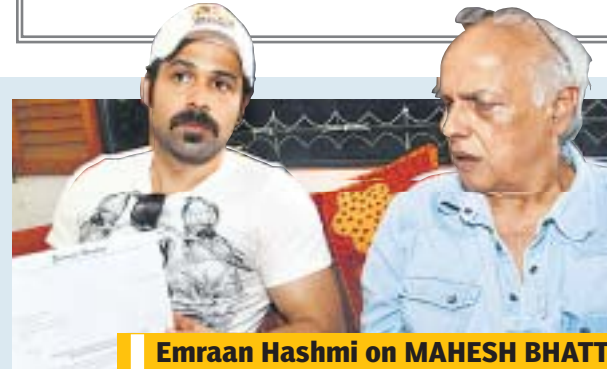
Emraan Hashmi on MAHESH BHATT