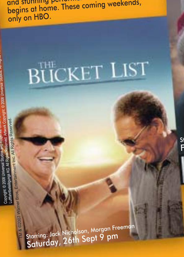
Starring: Jack Nicholson, Morgan Freeman Saturday, 26th Sept 9 pm