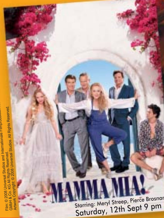
Starring: Meryl Streep, Pierce Brosnan Saturday, 12th Sept 9 pm

Catch an exciting line-up of premieres and stunning performances as the party begins at home. These coming weekends, only on HBO.